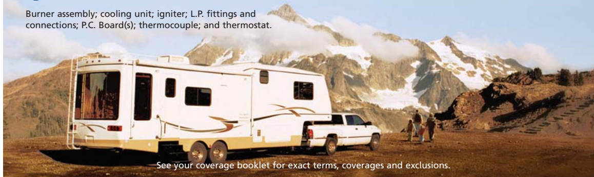
See your coverage booklet for exact terms, coverages and exclusions.

refrigerator 110 volt heat element; rear garage door system; reverse osmosis water system; roof horn system, roof TV antenna and head, manual or automated rotators, mercury switch, elevating gear (metal only), interior metal crank; safe; satellite radio; satellite system; security systems (factory installed); shore cord retractor; shower head, shower pan, shower stall, outside shower system (metal only); slide tray arm; sleep number beds; solar cells; solar panels; sub floor and basement compartment gas struts (worn or weak), suspension shackles; swing hitch; tire pressure monitor; TV (any size); TV antenna (factory installed); two-piece shower enclosures; water heater orifice, DSI, control valve, re-ignitor, pressure relief valve; water purifier (metal only), hot water dispenser (metal only), water lines and fittings (metal only), drain valves and manifold tube (metal only), lines (metal only), on/off valve (metal only); weather center (factory installed); and Web TV (factory installed).